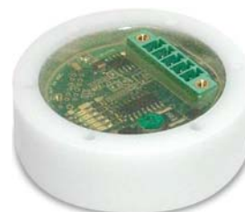
The Joral Hockey Puck Encoder