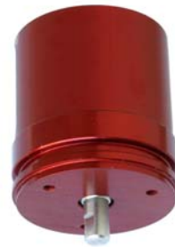
The J140 provides a servo ring and 3 face holes for mounting.